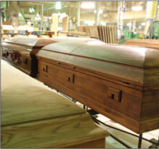
Caskets can be produced in any one of 350 different styles, 22 different stains, and three different finishes.