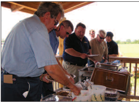
From there, it wasn't far to the new Stella-Jones/BPB plant in Fulton, Ky. But the first order of business was being treated to a tasty barbecue lunch with all the trimmings.