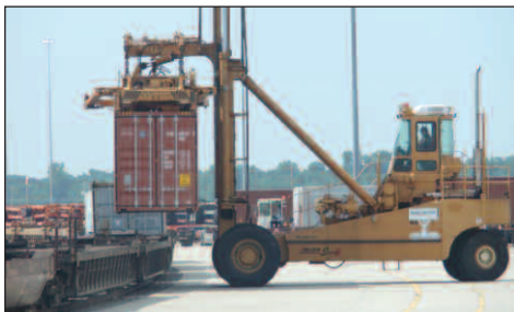
The third facility was the CN-CSX Transportation Gateway Intermodal Terminal—opened in 2005. With 1,800 parking spaces, two overhead cranes, and two sideload cranes, this operation can move massive numbers of containers on their way to your hometown.