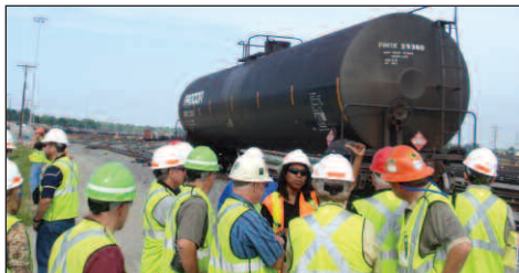
It's pretty amazing to stand by a track as huge gravity-powered freight cars rumble by.