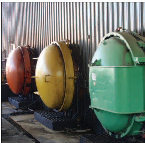
Treating cylinders are color-coded to ensure coordination between the loading process and the people in the back who oversee the treatment.