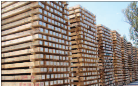
Some stacks at the Fulton plant are stickered and some use the German stacking method.