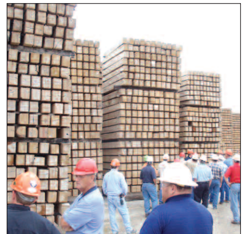
The stacks of air-drying ties at Koppers dwarf our tour group.