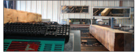
Large mirrors help during the grading process.