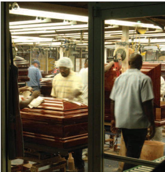
It was evident that great care and respect as well as outstanding craftsmanship go into each casket produced.