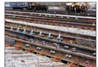
Joules (piston) "retarders" are strategically placed throughout the 45 different tracks to maintain each car's speed at 6, 4, and 2 mph. These upgrades have resulted in increased efficiency and decreased cost.