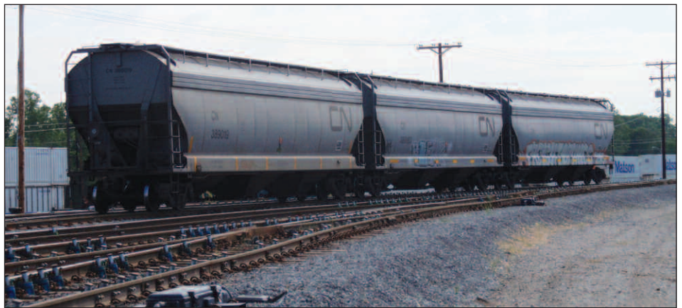
This project reconfigured the switching facility to include an automated mini-hump over which freight cars are directed by gravity into sorting tracks for train make-up. At the top, a scanner reads the car's bar code and determines its final destination. The car is uncoupled and allowed to roll freely through a variety of switches that are electronically controlled based on the destination until it couples onto the end of the other cars going to the same place.