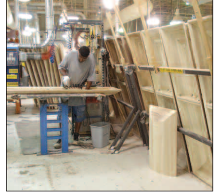
This plant uses eight primary-appearance wood species—cherry, mahogany, maple, oak, pecan, pine, poplar and walnut. Cottonwood is used extensively in the construction of casket frames.