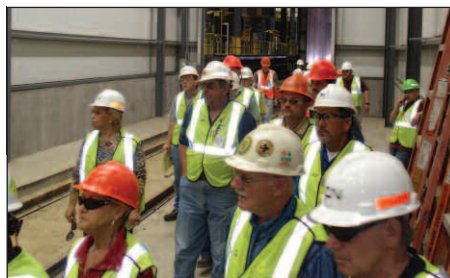
CN's new Locomotive Shop sits adjacent to their 100-year-old roundhouse and offers more efficient elevated platforms and a wash bay with room to work on three engines simultaneously.