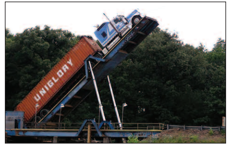
Wood chips arrive at the New Johnsonville, Tenn., plant in container cars that are pulled onto the receiving platform. The entire truck is raised to let the chips fall into the collection bin and off to processing.