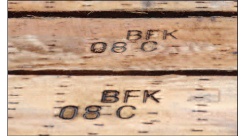
Face branding is a Canadian National requirement.