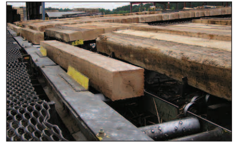
Untreated ties arrive and are sorted and stacked to air dry prior to treatment.