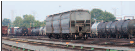
This yard can handle more than 3,100 freight cars from 35 or more freight trains per day on 300,000 track feet of new construction.

The first stop included three different facilities within Canadian National's huge Memphis operation.