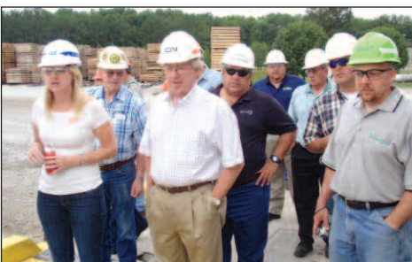
Day 2 began with a visit to the big Koppers treating plant in Guthrie, Ky.