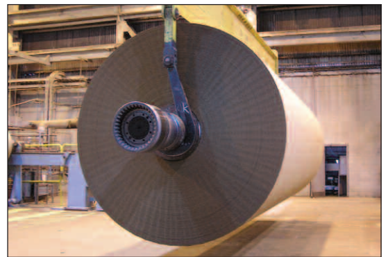
Each large reel is moved to the winder. Here, it is cut into smaller rolls for shipment to various box plants. These rolls weigh between two and three tons. This plant uses 1,000 tons of chips & 500 tons of recycled boxes to produce 1,000 tons of paper per day.